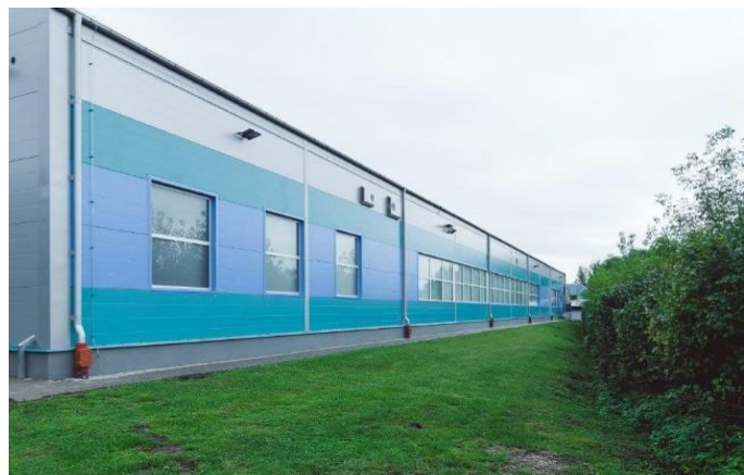
Fig.: The production plant in Latvia

There were major changes in Latvia last year. Our production plant there was upgraded and expanded, which now makes it possible to meet the increased demand.