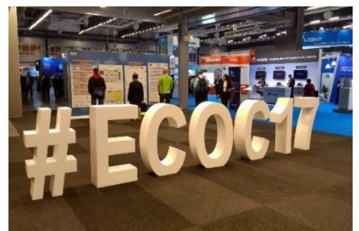
Entrance area to the ECOC in Gothenburg

CeramOptec will visit other trade fairs by the end of the year, such as the “ fmb ” in Bad Salzuflen from 8 - 10 November 2017 , the “ Productronica ” in Munich from 14 - 17 November 2017 and the “ Formnext ” in Frankfurt on the same dates. In cooperation with parent group biolitec®, CeramOptec will be represented with a stand at the “ Medica ” in Düsseldorf from 13 - 16 November 2017 .