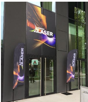
Entrance to the Espace Laser in Strasbourg

“ Espace Laser ” took place from 12 - 14 September 2017 in Strasbourg, France , and was followed immediately by the “ ECOC 2017 ” in Gothenburg, Sweden , from 17 - 21 September 2017 .